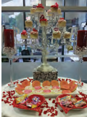
Our Marathon Tower members were treated to a tasty tower of treats that was almost too pretty to eat!