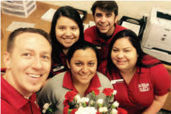
UH – Our Coog crew shared the love by handing out over 250 carnations on campus, along with Valentine's candy and "Be Mine" cards.

This Valentine's Day we showed our members how much we loved them, while also raising money and awareness for the American Cancer Society.