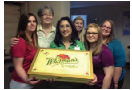
One of our Cuero members treated the team to a box of Valentine's candy big enough for the record books!