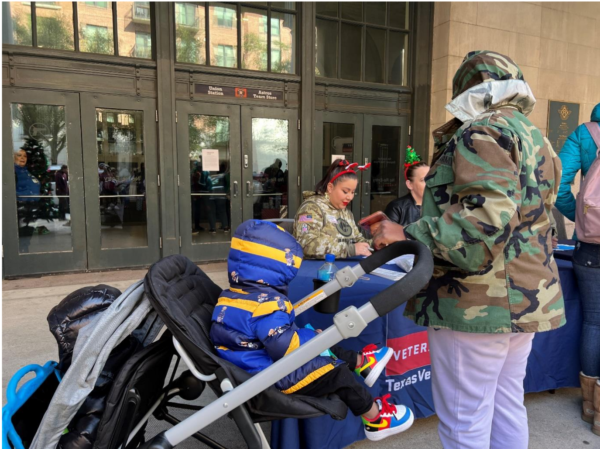
TDECU volunteers greet veteran families arriving at Operation Santa at Minute Maid Park.

TDECU joined forces with Combined Arms as the proud presenting sponsor of the 13th annual Operation Santa benefiting military and veteran families at Union Station at Minute Maid Park hosted by The Astros Foundation this past Sunday, Dec. 18.